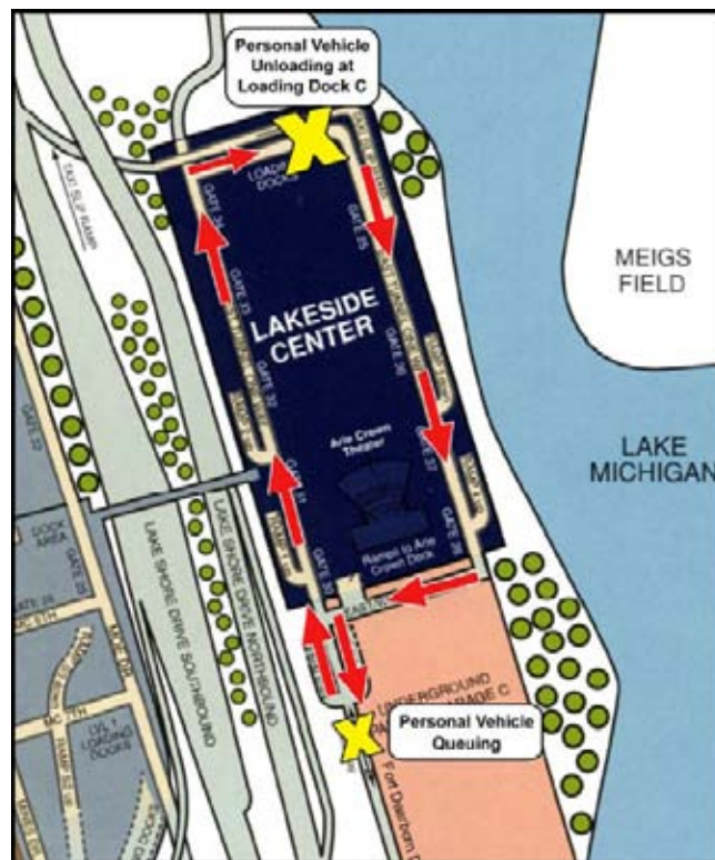
(Fig. 3) Fort Dearborn Drive POV queuing