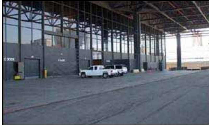
(Fig. 6) Loading Dock C

Move-In / Move-Out Procedure for POV Exhibitors C 2 E 2 will provide free labor for both move-in and move-out. Please review the details and qualifications closely: