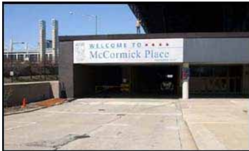
(Fig. 5) Entrance to the Loading Docks