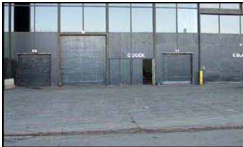
(Fig. 7) Loading Dock C