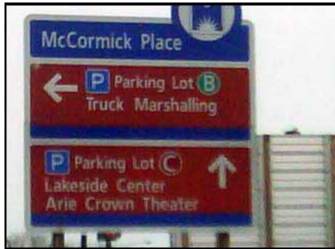
(Fig. 2) Lake Shore Drive South exit ramp and 31 st Street

Move-In / Move-Out Procedure for POV Exhibitors C 2 E 2 will provide free labor for both move-in and move-out. Please review the details and qualifications closely: