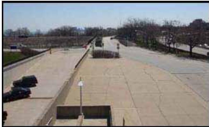
(Fig. 4) Fort Dearborn Drive POV queuing

Move-In / Move-Out Procedure for POV Exhibitors C 2 E 2 will provide free labor for both move-in and move-out. Please review the details and qualifications closely: